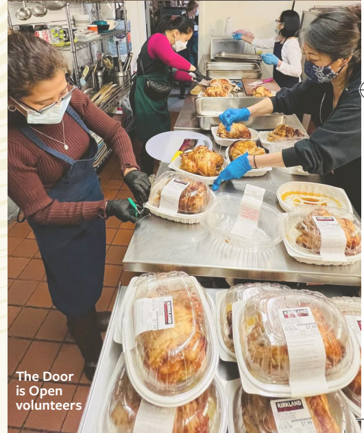
The Door is Open volunteers