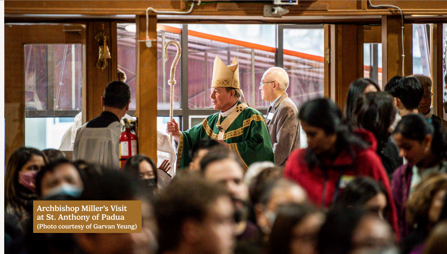
Archbishop Miller's Visit at St. Anthony of Padua