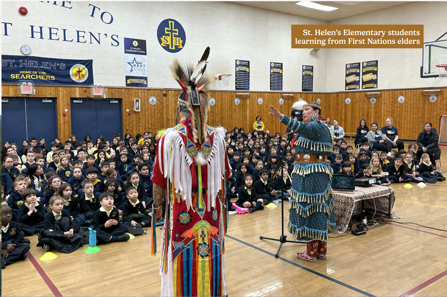
St. Helen’s Elementary students learning from First Nations elders