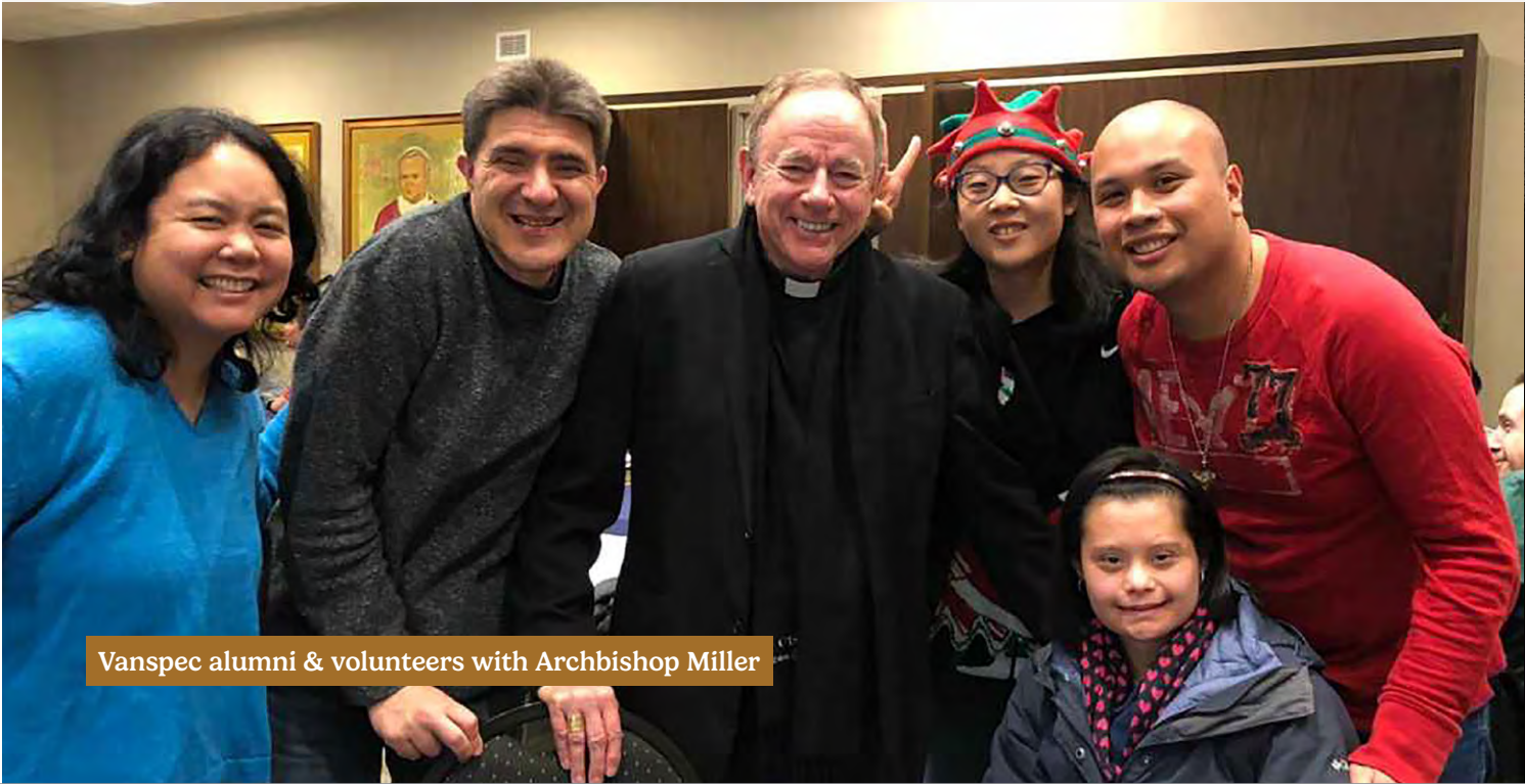
Vanspec alumni & volunteers with Archbishop Miller