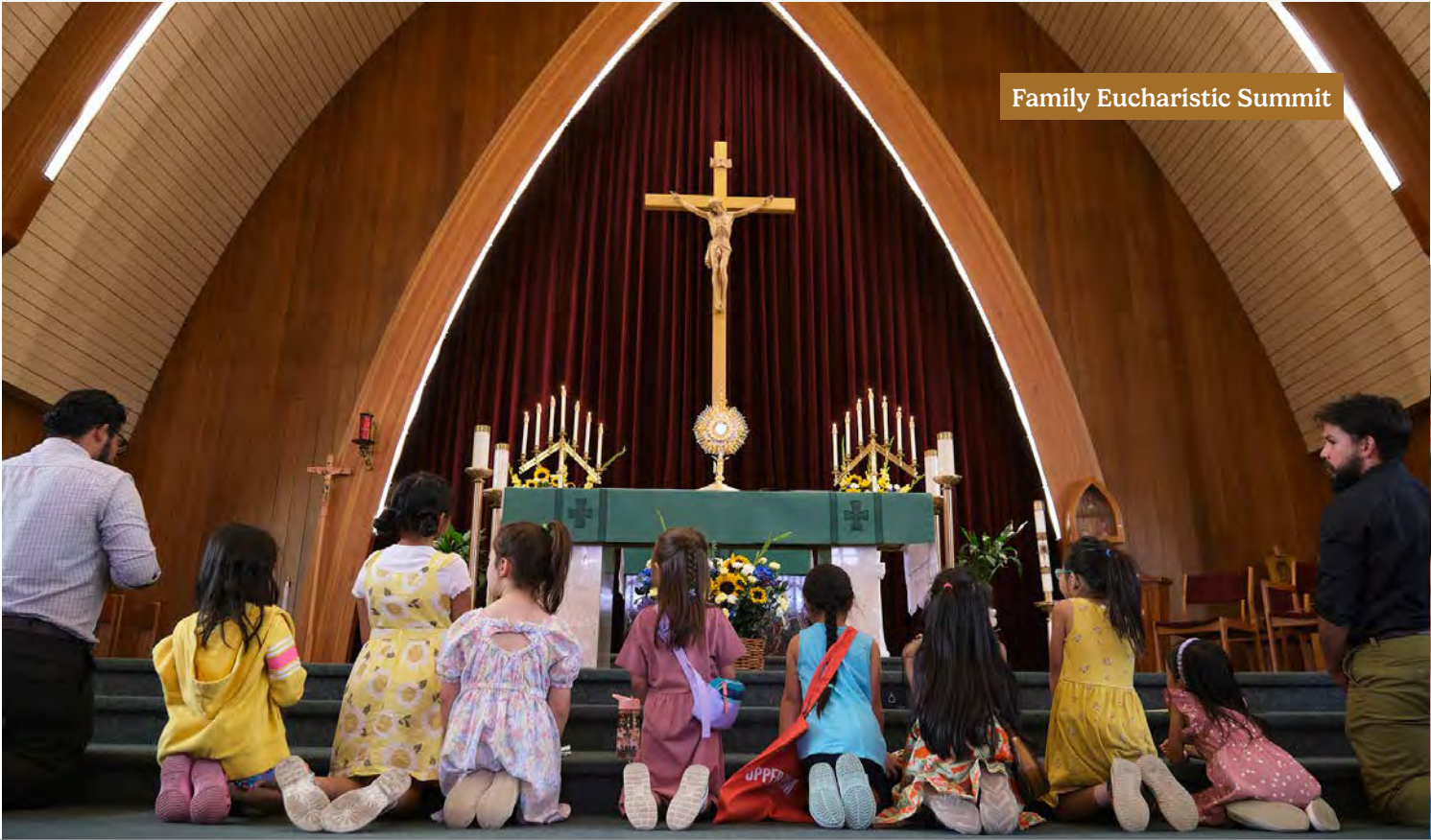
Family Eucharistic Summit

We offered two retreats for Catholics who have gone through divorce or separation.