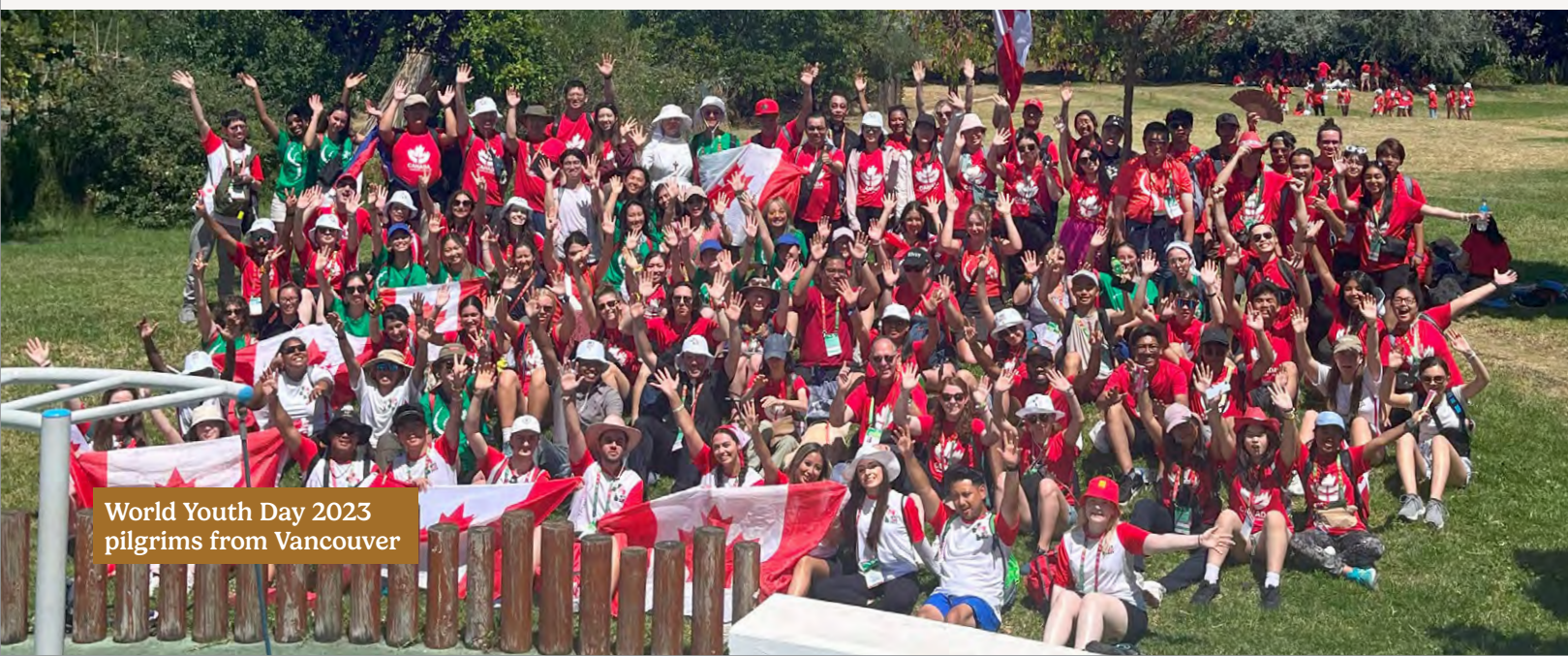
World Youth Day 2023 pilgrims from Vancouver