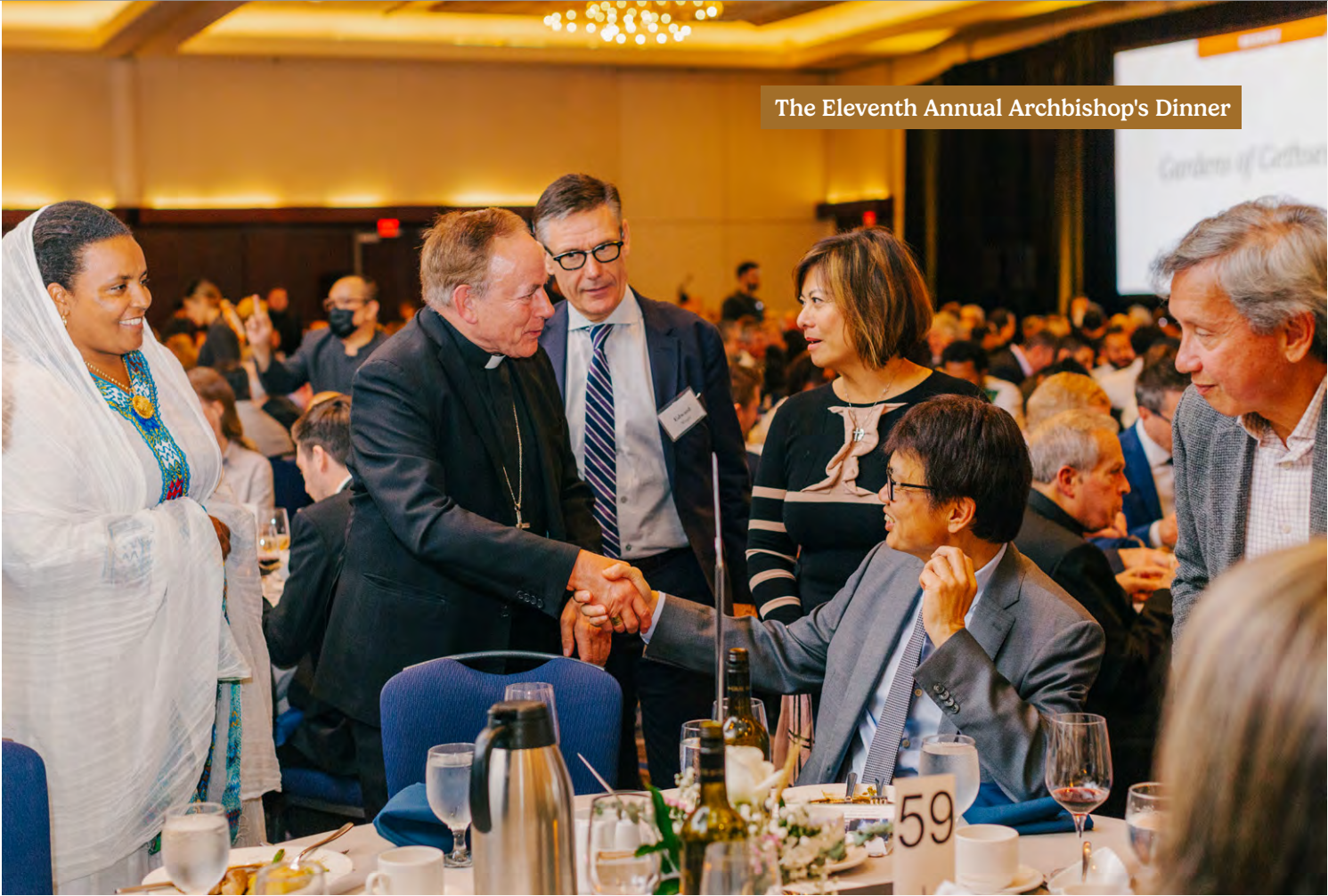
The Eleventh Annual Archbishop's Dinner