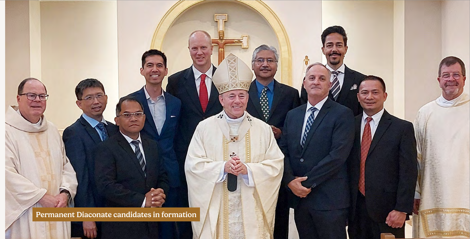
Permanent Diaconate candidates in formation