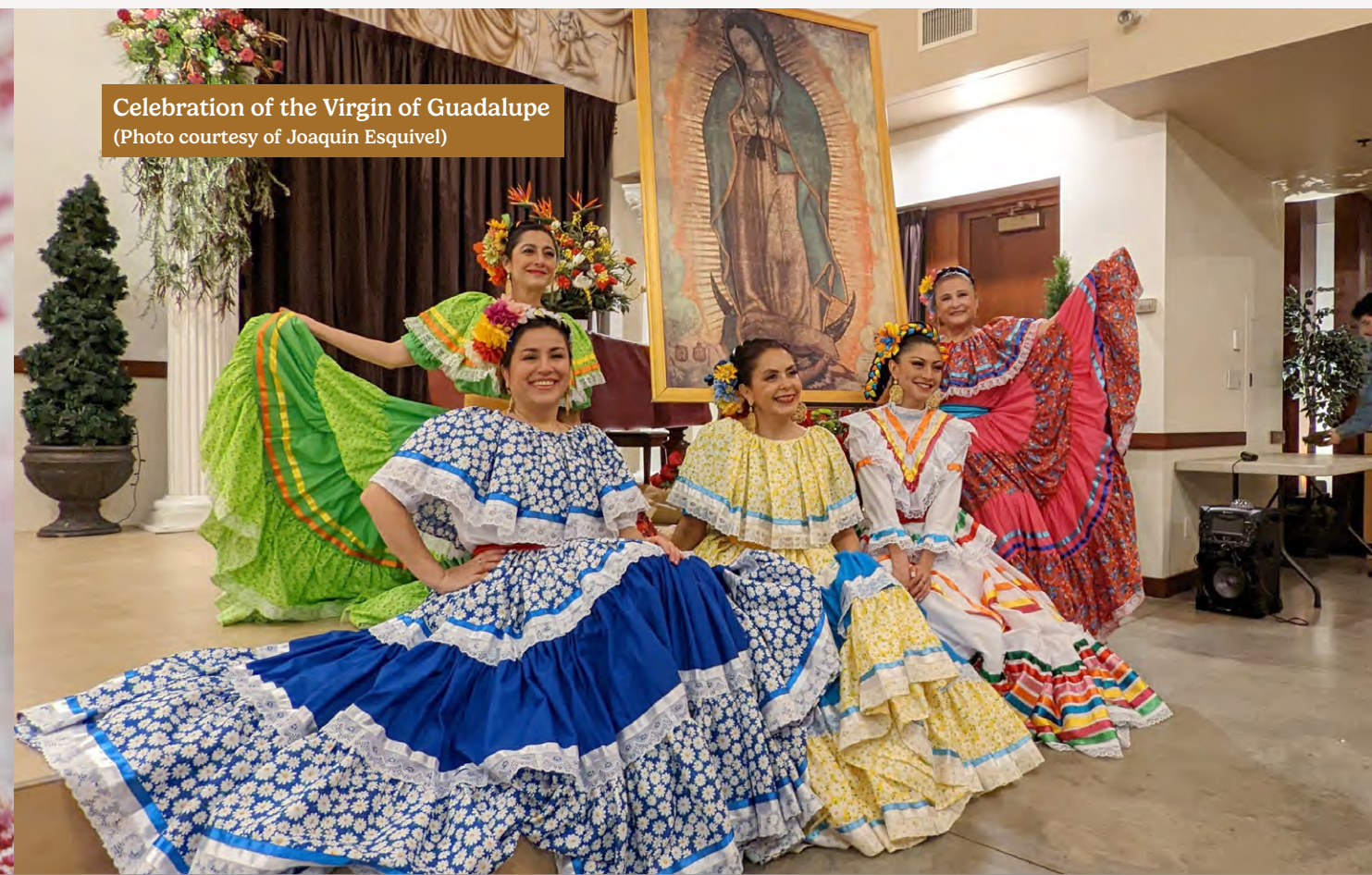
Celebration of the Virgin of Guadalupe