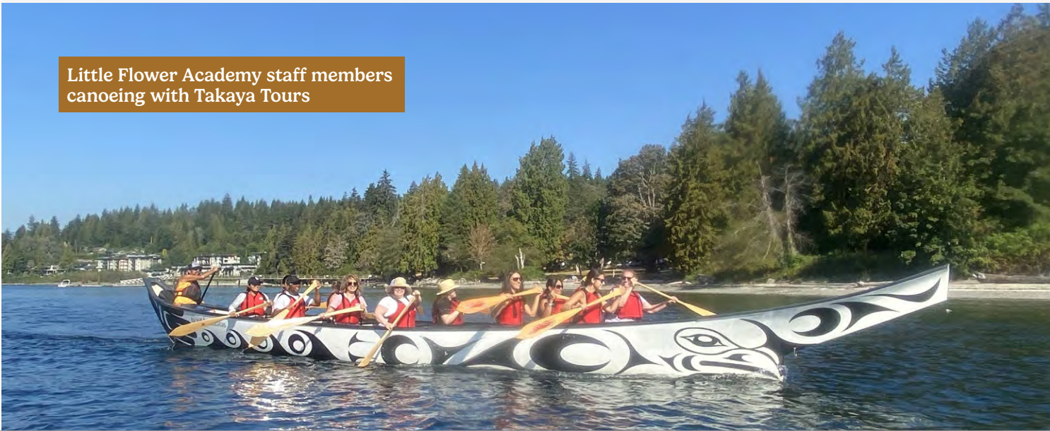
Little Flower Academy staff members canoeing with Takaya Tours