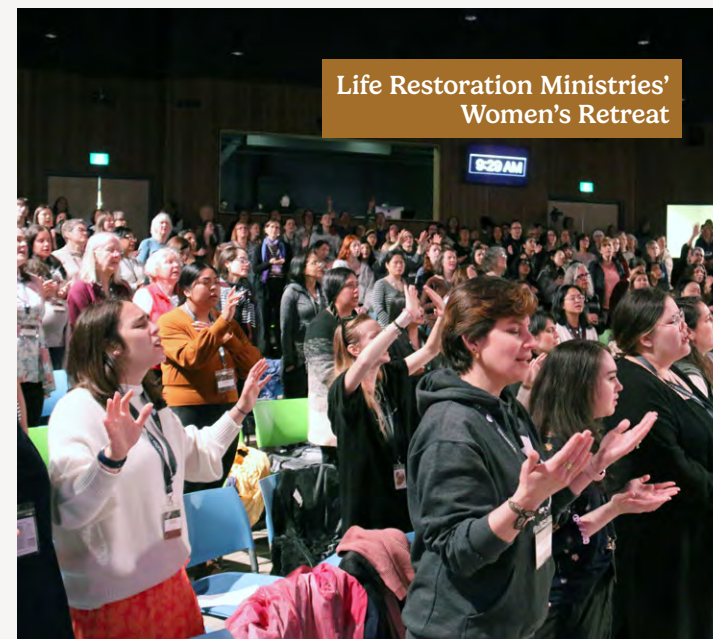
Life Restoration Ministries' Women's Retreat