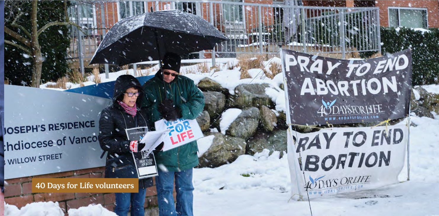
40 Days for Life volunteers

When we erect the Healing Pole it will spread love instead of triggered feelings. Additionally, it will symbolize a new beginning of healing for our Sts'ailes people.