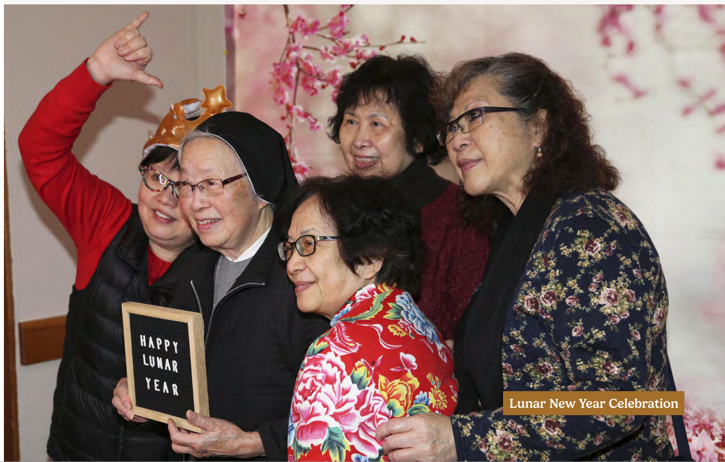
Lunar New Year Celebration