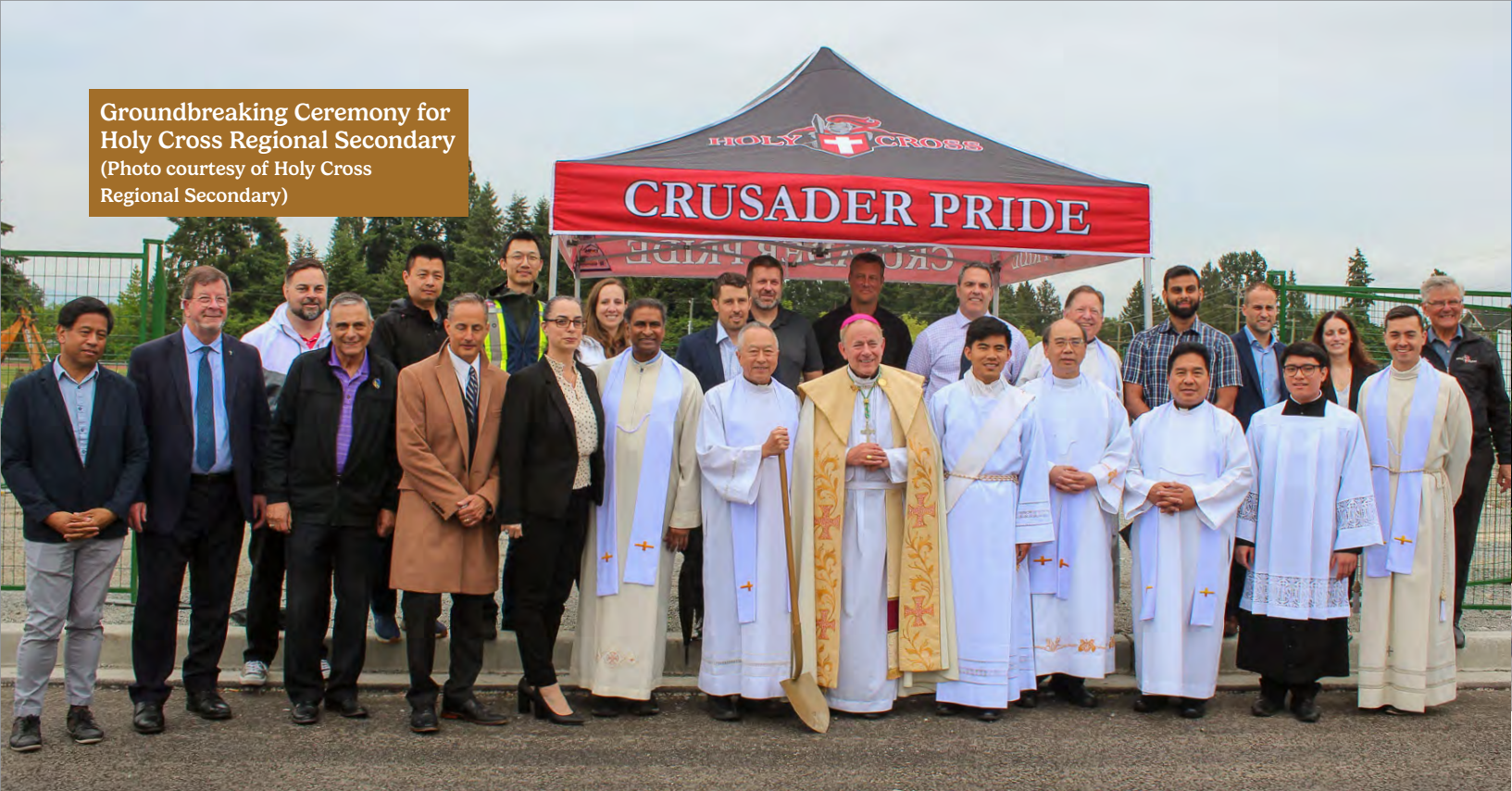
Groundbreaking Ceremony for Holy Cross Regional Secondary