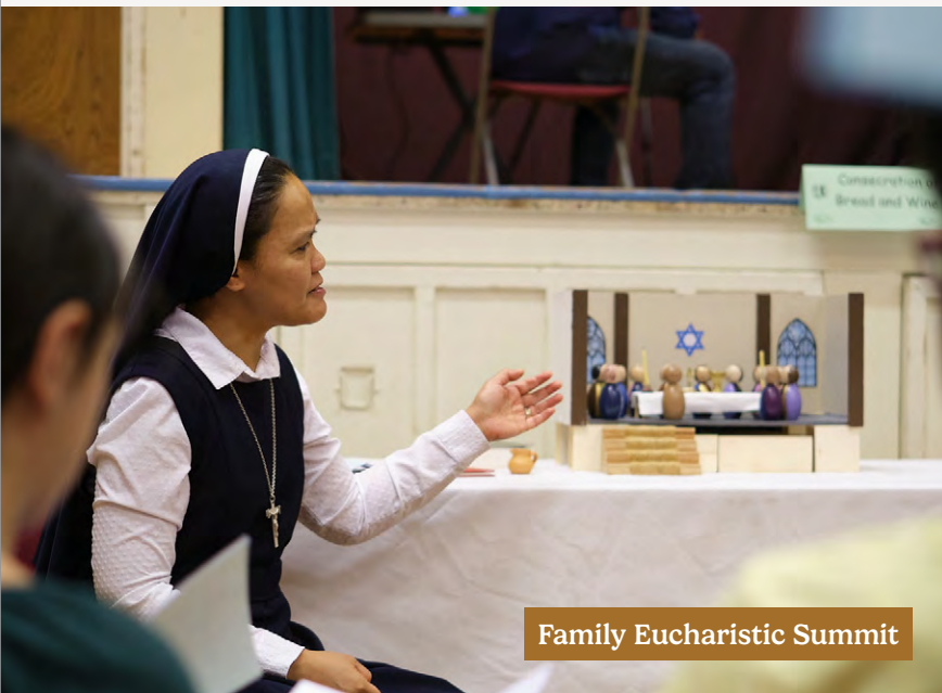
Family Eucharistic Summit