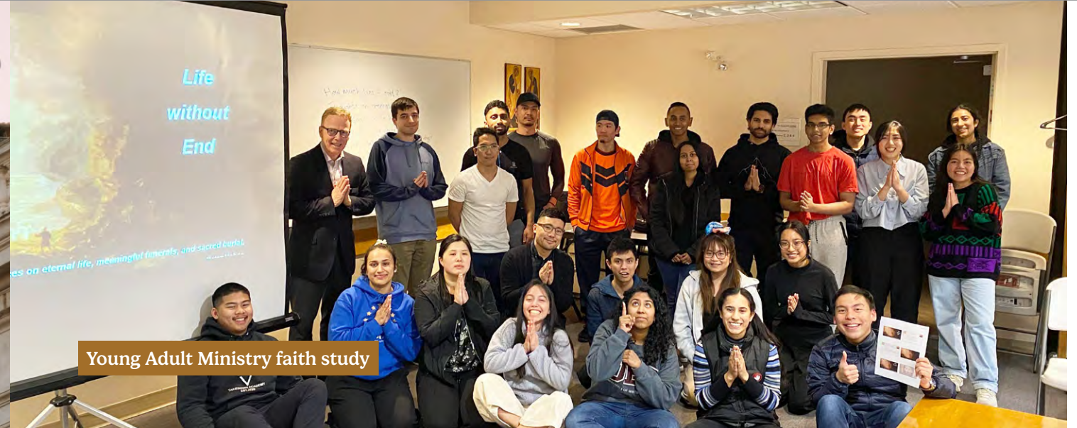
Young Adult Ministry faith study