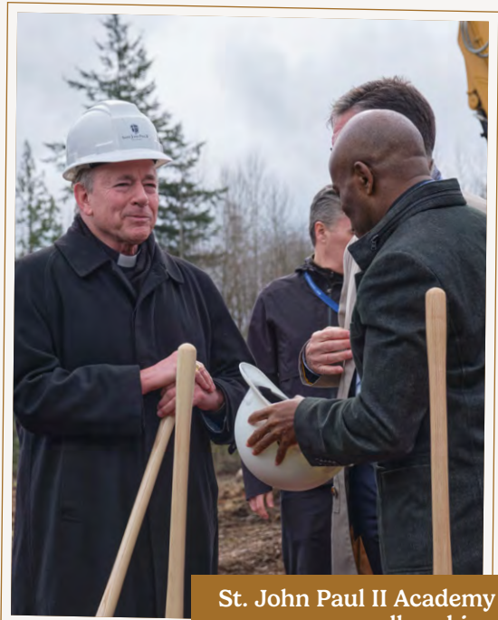
St. John Paul II Academy groundbreaking