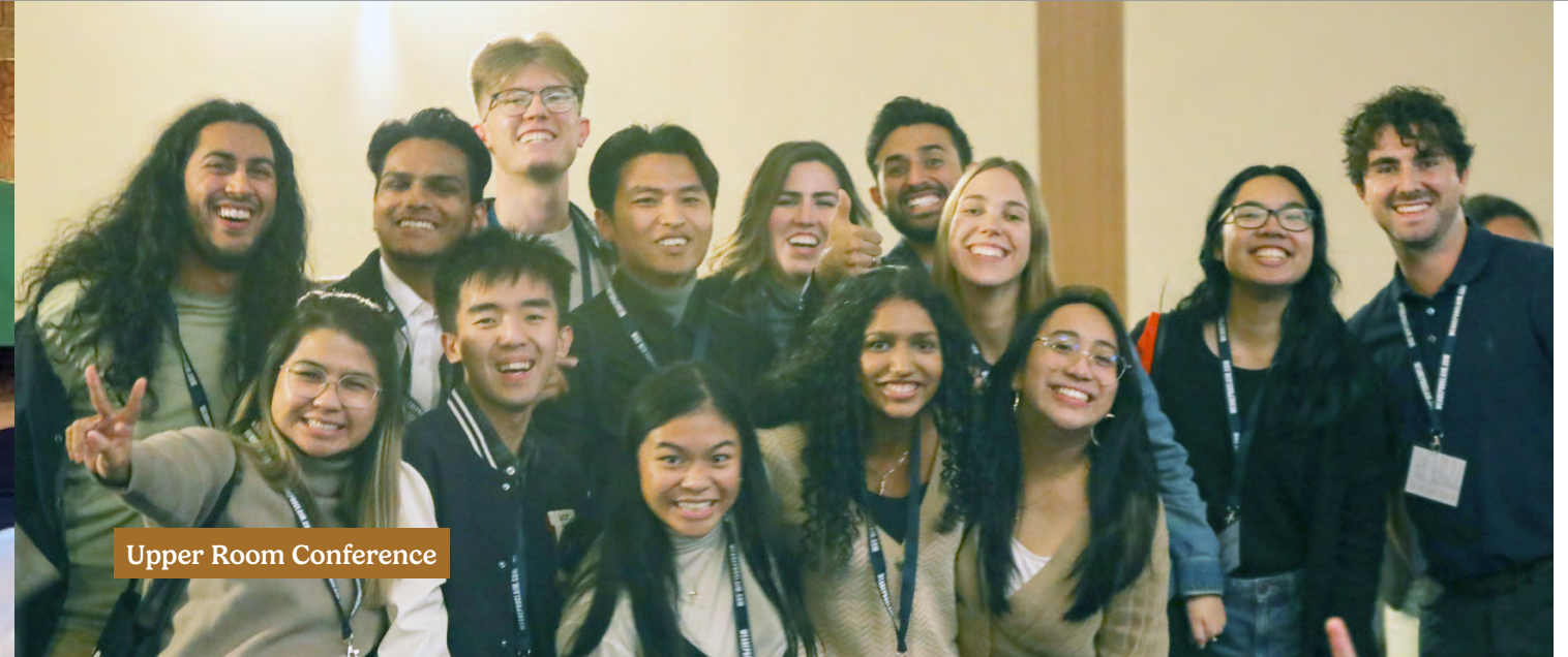
Upper Room Conference