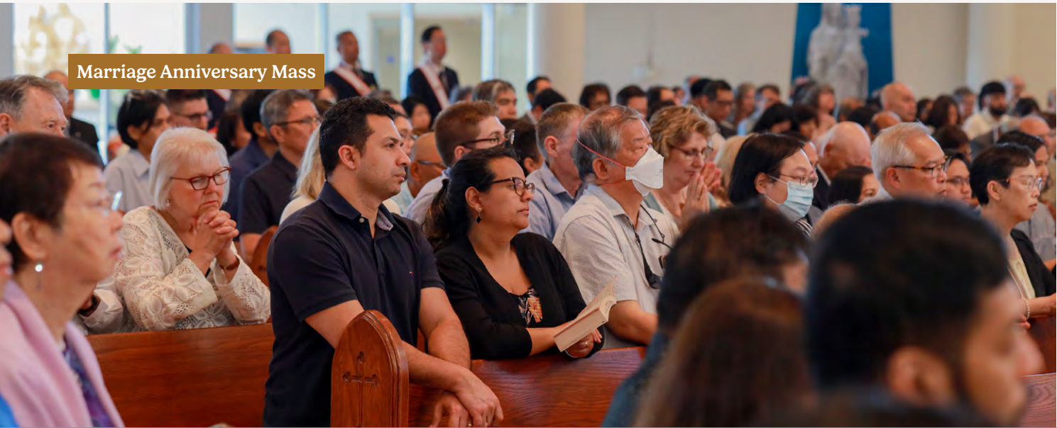
Marriage Anniversary Mass