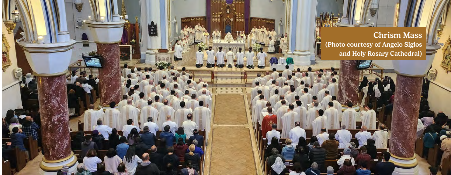
Chrism Mass