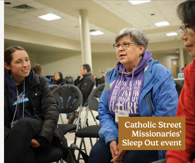
Catholic Street Missionaries' Sleep Out event