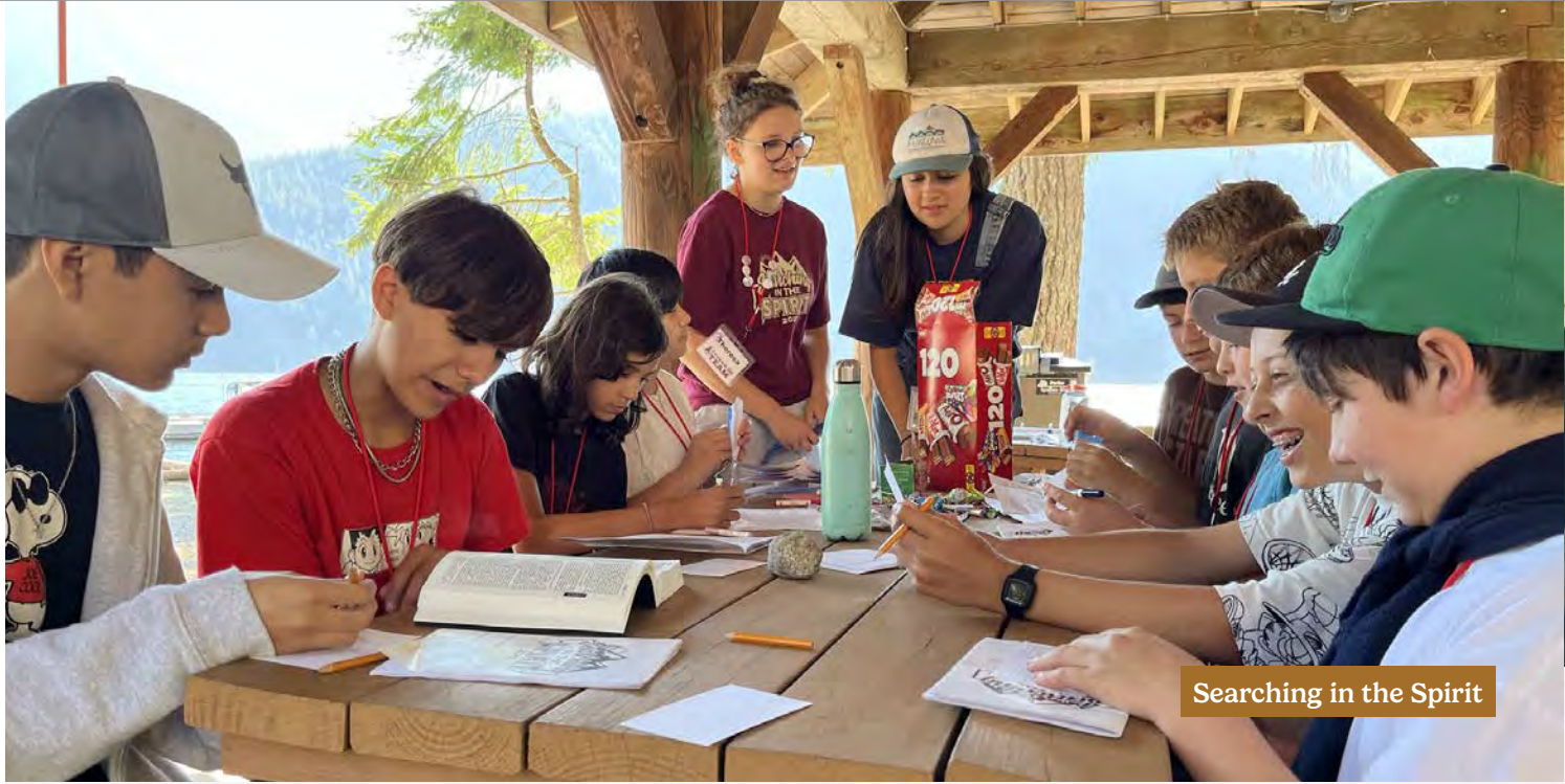
Searching in the Spirit