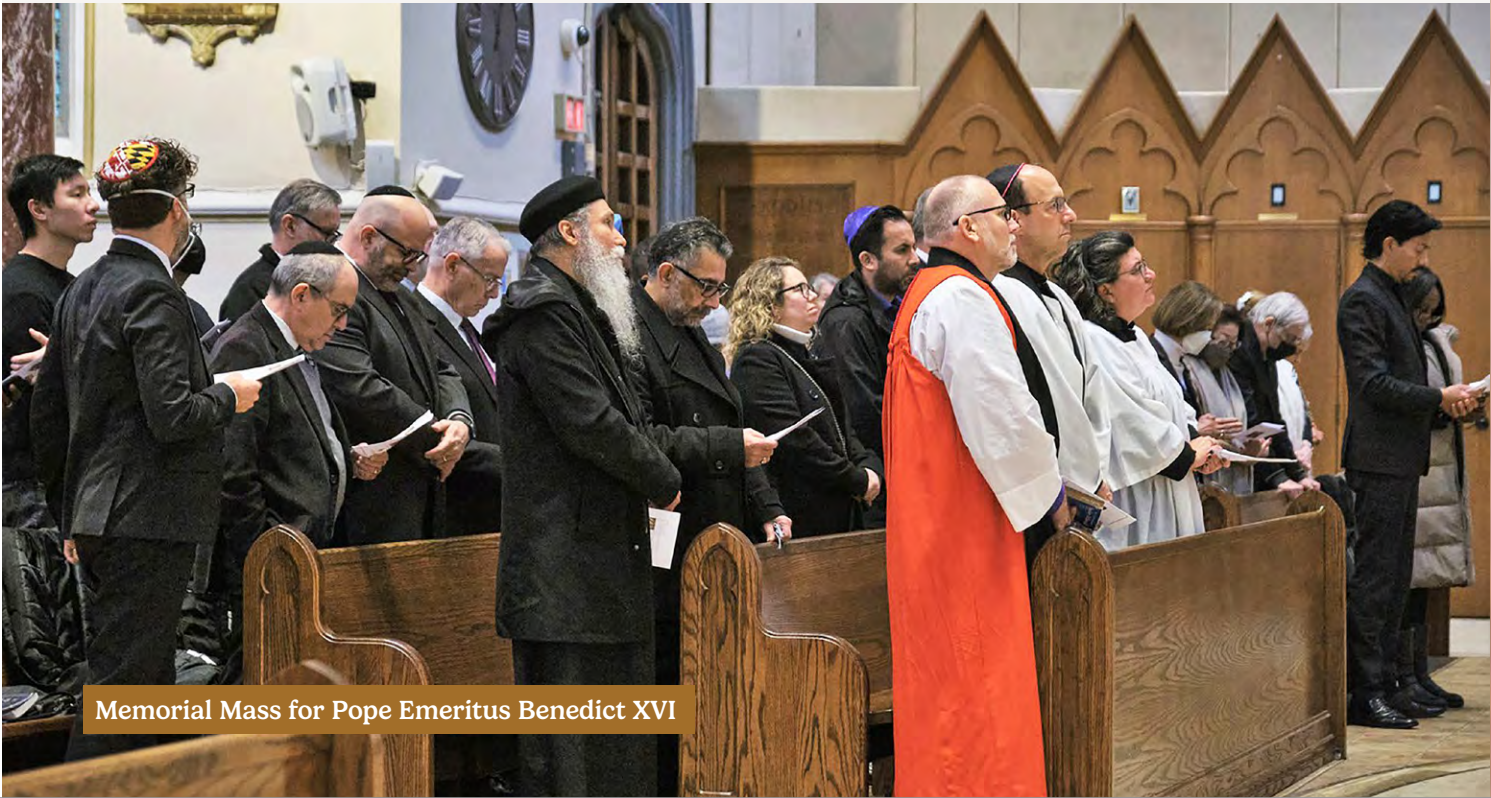
Memorial Mass for Pope Emeritus Benedict XVI

The members of the Anti-Human Trafficking Committee find that education opens the minds and hearts of people who would otherwise have no understanding of how the dignity of the human person is consistently under siege in Canada. Educational tools and training were made available for parishes and parish groups using the Working Towards Freedom Study Guide based on the CCCB Pastoral Letter For Freedom Christ Has Set Us Free .