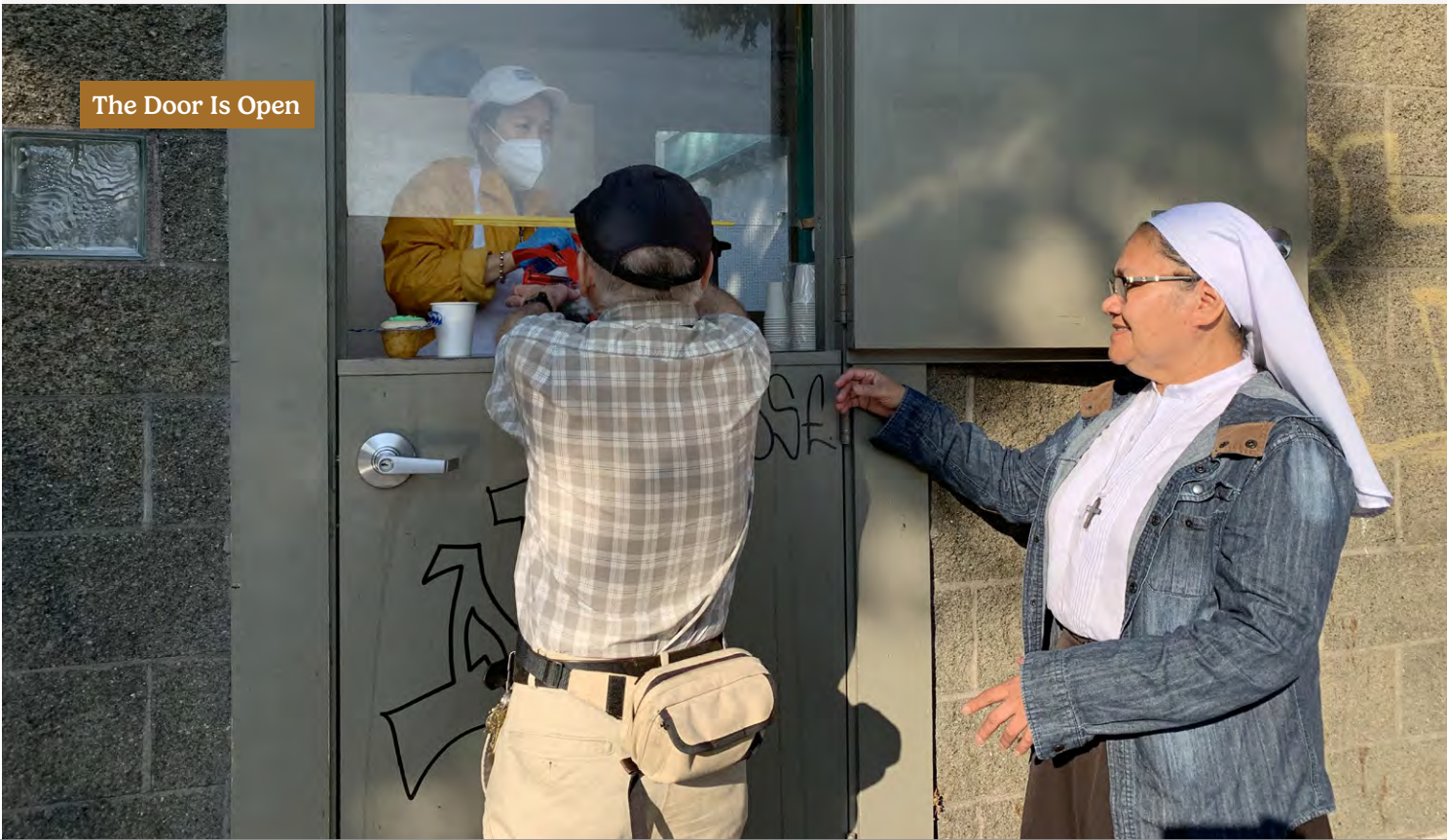
The Door Is Open