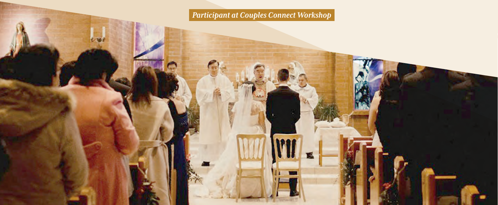
Participant at Couples Connect Workshop

I ENJOYED THIS MORE THAN I THOUGHT I WOULD. WE, AS A COUPLE, CONNECTED IN NEW WAYS AND DISCOVERED PARTS OF US THAT NEEDED IMPROVEMENT.”